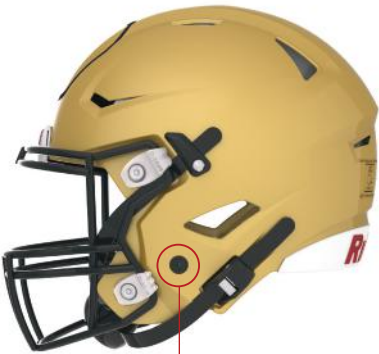
Face Frame Pads (Left/Right)